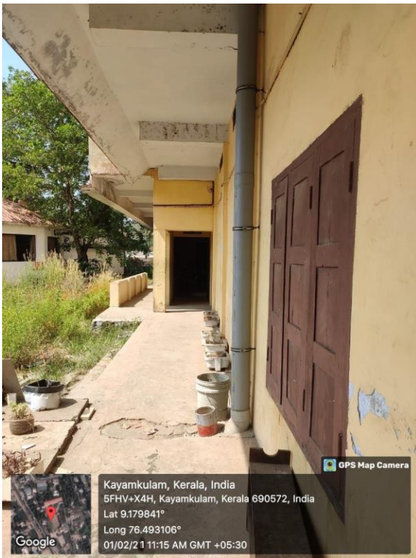
3)RAIN WATER HARVESTING